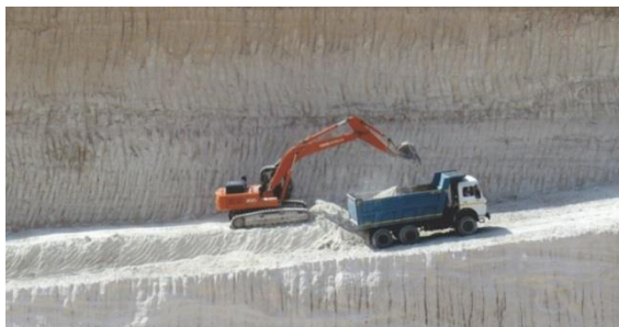
Crude China Clay